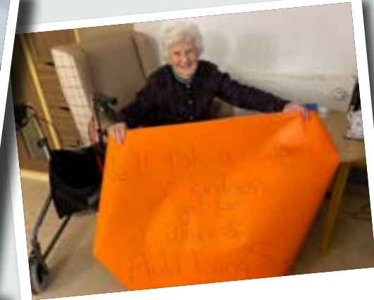
Veterans celebrated Burns Night with some poetry