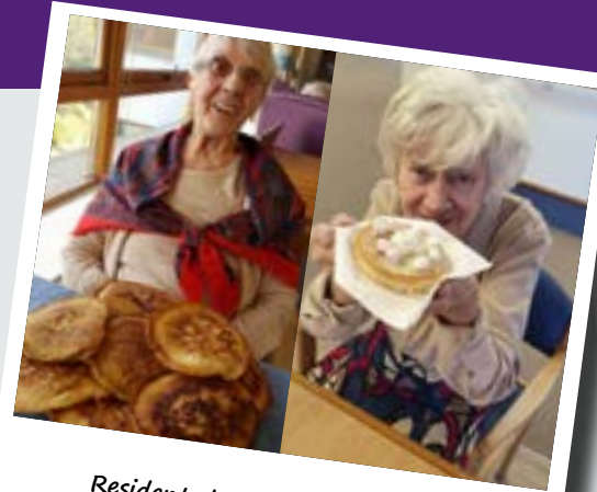
Residents had a flipping good Pancake Tuesday!

Here's a few snippets from Autumn 2020 to now: