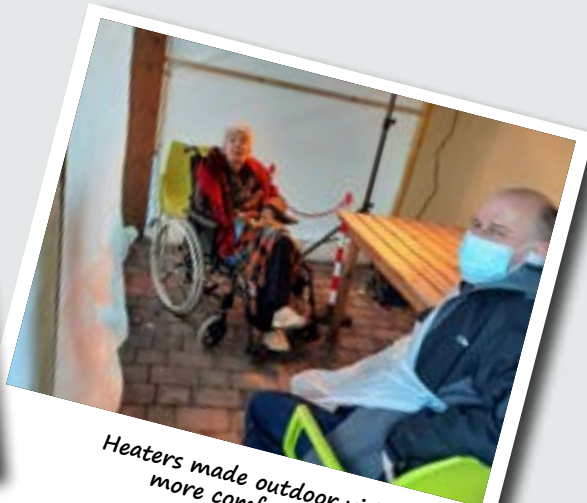
Heaters made outdoor visits more comfortable