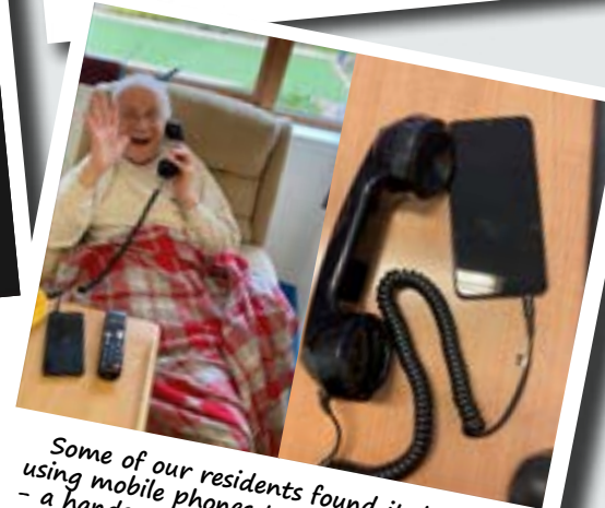
Some of our residents found it difficult using mobile phones to speak to loved ones - a handset which plugs into a mobile now makes it more like an older phone